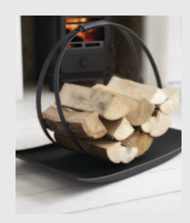
Loop Ring Log Basket Part no: 62916921

Always use genuine Morsø spares available from authorised dealers – it is your way of guaranteeing your stove will provide you with many years of comfort and warmth.