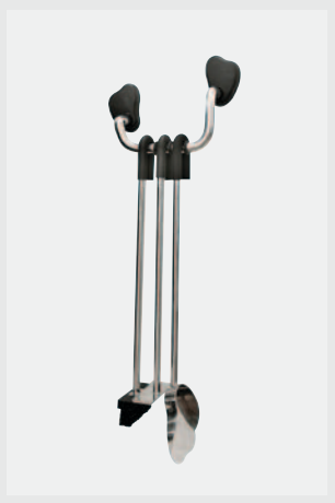
7600 Series Tool Set Part no: 62930100