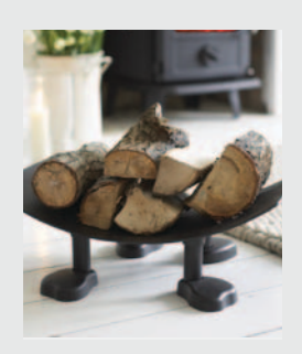
7600 Series Feet Log Holder Part no: 62930400