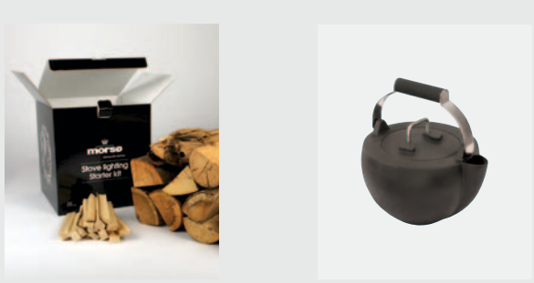
Starter PackHumidifierPart no: 62904458Part no: 62930200