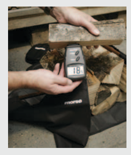
Moisture Meter Part no: 62929900