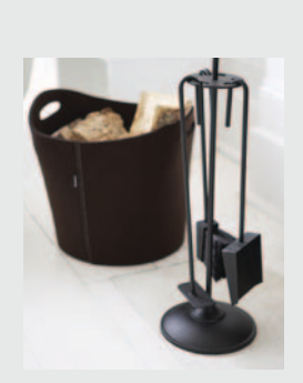
Classic Fire Tools Part no: 62900221