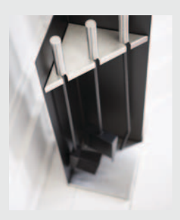
Fire Tools Choice Part no: 62916621