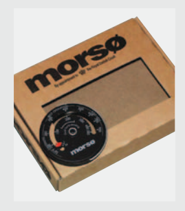
Flue Gas Thermometer Part no: 62901200